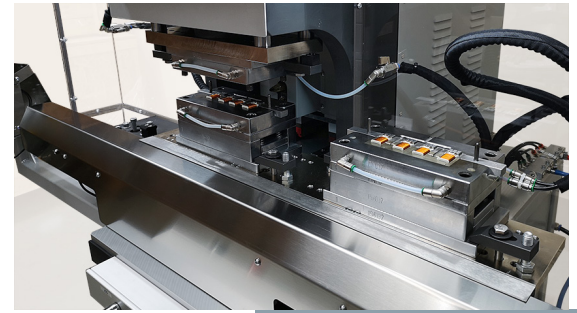
Shifting Mold Table

The unit works with Technomelt, Thermelt and Macromelt resins and Hot Melt polyamide and polyolefin resins.