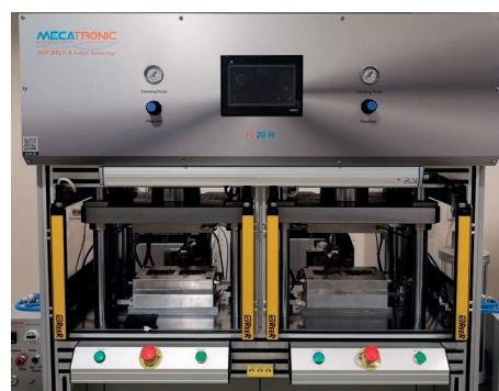
Dual working station

The unit works with Technomelt, Thermelt and Macromelt resins and Hot Melt polyamide and polyolefin resins.